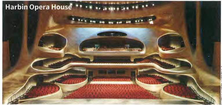
Harbin Opera House

The 34 th Annual IALD International Lighting Design Awards named 22 award winners representing projects from eight countries, including interiors, monuments, façades, museums and a residence.