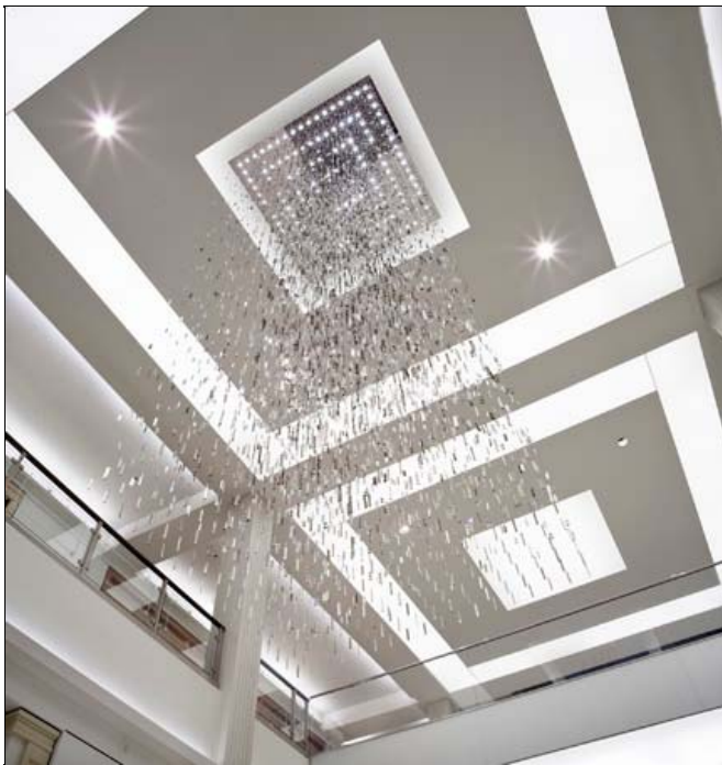
The juxtaposition of polished and matte finishes is enhanced by direct lighting. In combination, a more relaxed and defined space was created.